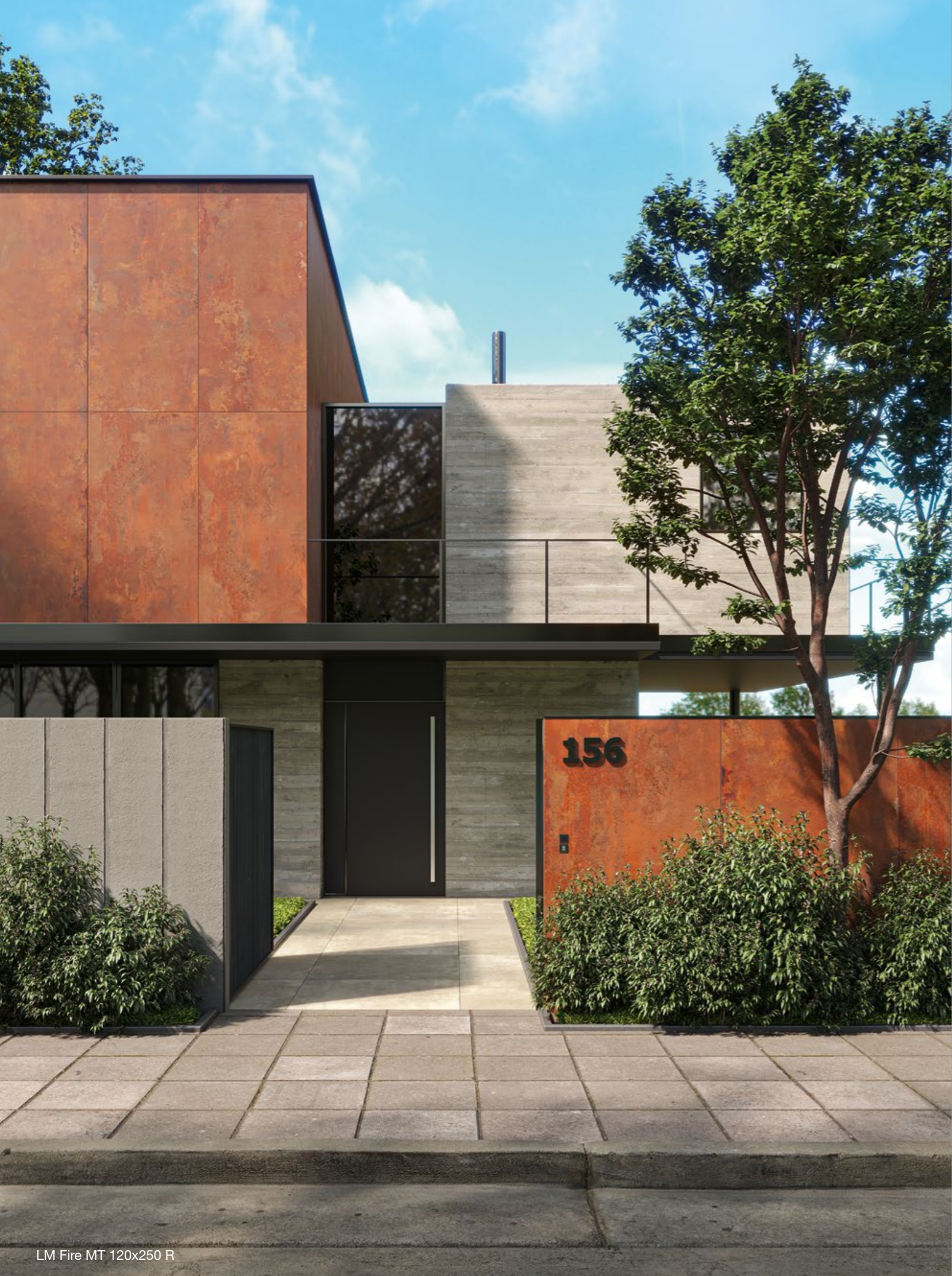
LM Fire MT 120x250 R